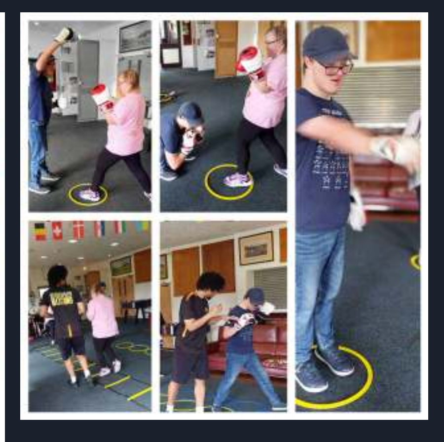
Egham Boxing Workshop Instructors warming the group up before learning the boxing techniques & sparring.